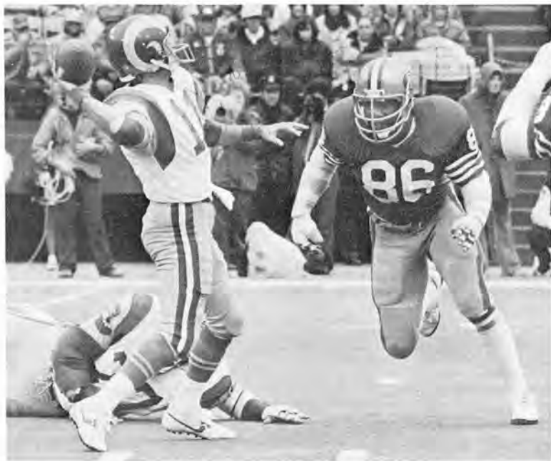
CEDRICK HARDMAN ZEROS IN ON PAT HADEN

PERSONAL: Hardman is a popular public speaker in the Bay Area, and also has made several appearances in movies and television. He makes his home in Menlo Park, Calif.